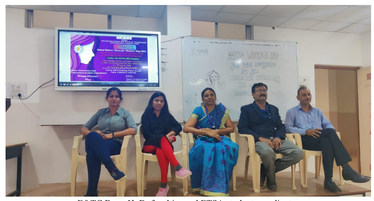
E&TC Dept. HoD, faculties and ETSA student coordinator