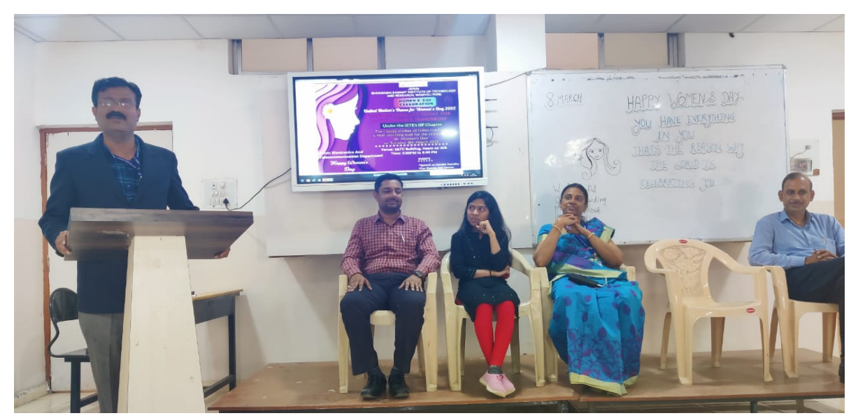
HOD speech on International Women's Day